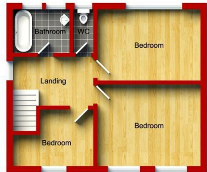
First Floor Approximate Floor Area (44.10 sq.m)