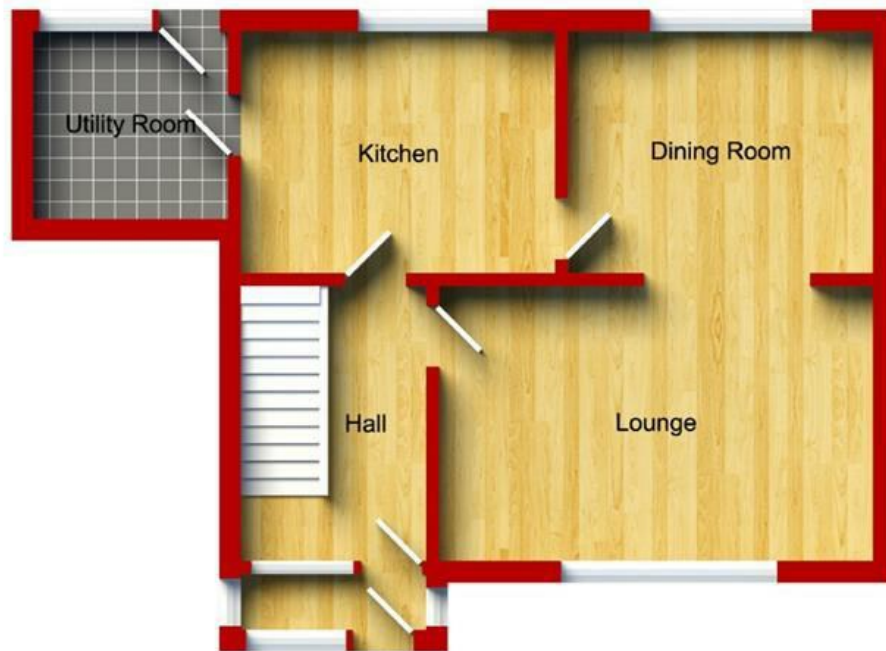
Ground Floor Approximate Floor Area (50.80 sq.m)